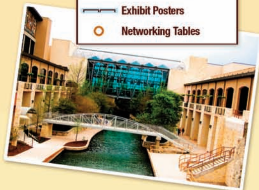
EXHIBIT DATES & TIMES