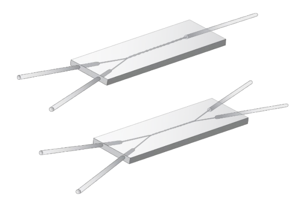
Fig 2: Hummingbird Nano "Y" and "X" style mixer chips.

Hummingbird Nano offers two versions of mixing chips (Figure 2): the conventional "Y" style mixer with two inputs and a single output, and the novel "X" style mixer that allows two streams to be mixed and then split into separate streams for further processing. Both chip styles have smooth, circular channels that come together to form a double helix in the mixing region. The chips are cast as a single piece, eliminating bonding and its associated challenges.