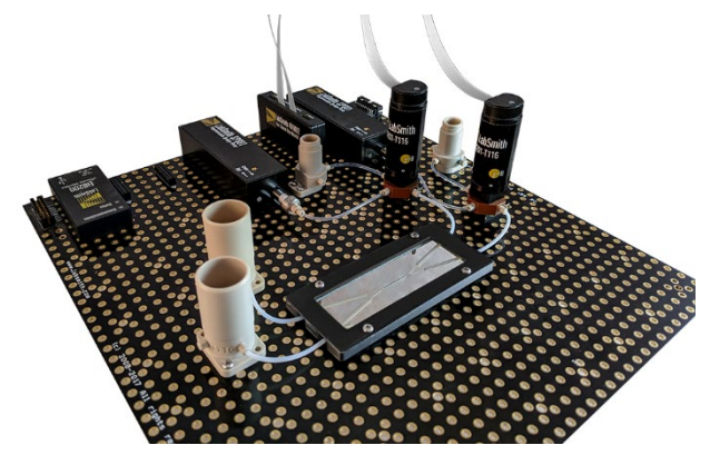
Fig. 1: uProcess setup with Hummingbird "X" style chip.

Figure 1 shows a LabSmith uProcess breadboard, syringe pumps, valves and reservoirs with the Hummingbird Nano "X" style mixer chip. The chip includes integrated 1/16" OD tubing that connects directly to the uProcess components for smooth transitional flow with no dead volume. Table 1 shows the components used for this application.