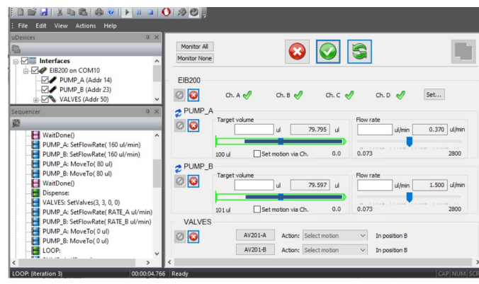
Fig. 3: uProcess software control panel.

Several methods are available to measure concentration. In this example, each effluent is collected in cuvettes, and percent volume concentration is measured using a colorimeter. Reagent A is 100% DI H<sub>2</sub>O, and Reagent B is DI H<sub>2</sub>O with 3.26% dye (by volume). As shown in Figure 3, the two syringe pumps load the reagents and then dispense at the desired flowrates.